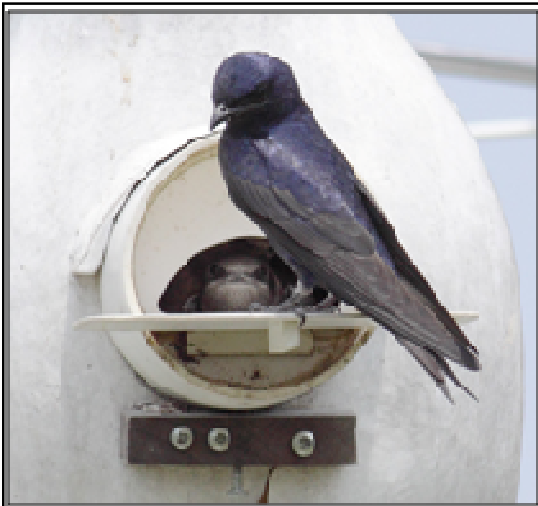
Photo of male and female Purple Martins

For further questions, contact (434) 962-8232 or kingston@cstone.net