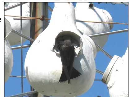
Purple Martin feeding nestlings