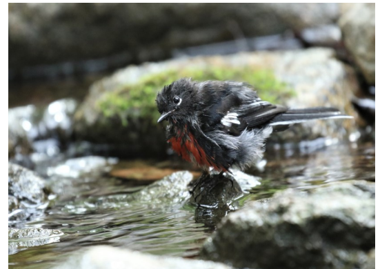
One of the iconic birds spotted during the week, a Painted Redstart bathes in a creek.

I offer my heartfelt thanks to the Virginia Bluebird Society for awarding me a scholarship towards Camp Chiricahua. I hope these words give you a sliver of the experience you helped provide me with. Thank you.