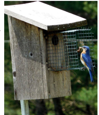
Male bluebird with food.

Do you have a question for the next newsletter's Bluebird Advisor? Send it to woolwinehouse@gmail.com