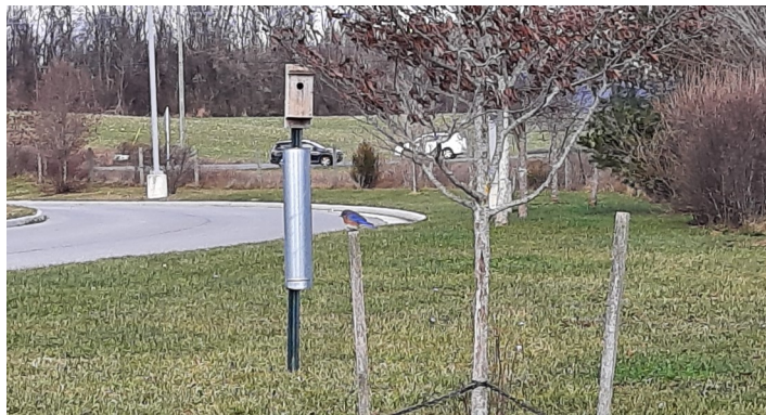
Waiting for spring: new homes available at the Prices Fork Elementary School