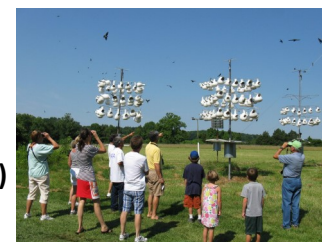
Participants view Purple Martin supercolony