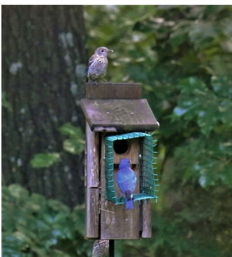
A fledgling with food waits for a chance to help feed siblings.