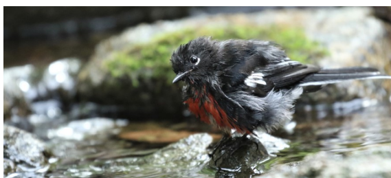
A Painted Redstart observed at Camp Chiricahua Youth Birding Camp.

The application form, available on the VBS website at https://www.virginiabluebirds.org/about-vbs/grant-programs must be completed by May 1, 2021.