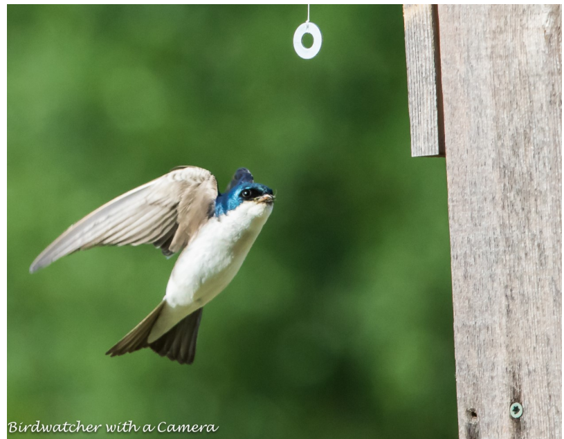
Birdwatcher with a Camera