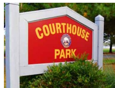
Left and right: Hanover's two newest Bluebird Trail locations

After the first round of nestings this year we have 56 Bluebird eggs and 15 Carolina Chickadees.