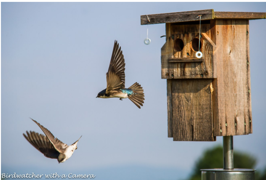
Birdwatcher with a Camera

Top: Bluebird box with deterrents (hex nuts) hanging on fishing line