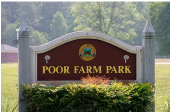
Left: site of first Hanover Bluebird trail