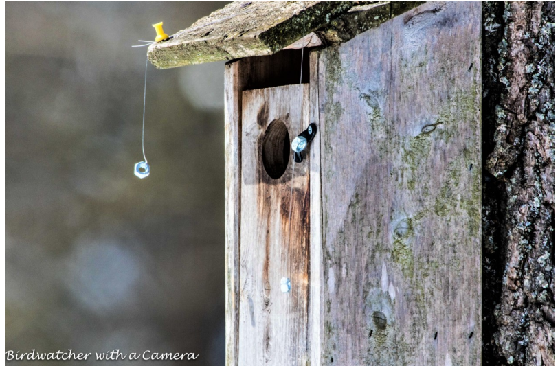
Birdwatcher with a Camera

If you have House Sparrows, give this a try.