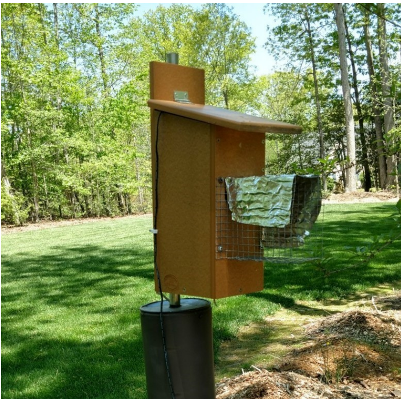
Top: House Wren pecking at Chickadee hatchlings

We hope this simple solution continues to work and our house wrens find places to nest elsewhere. They are cute little birds but we can't let them dominate on our trails.